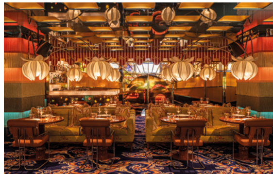
JNcQUOI Frou Frou