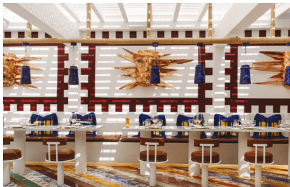
JNcQUOI Deli Comporta