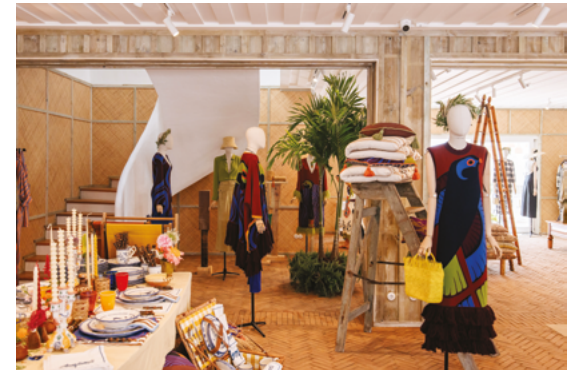
Fashion Clinic Comporta