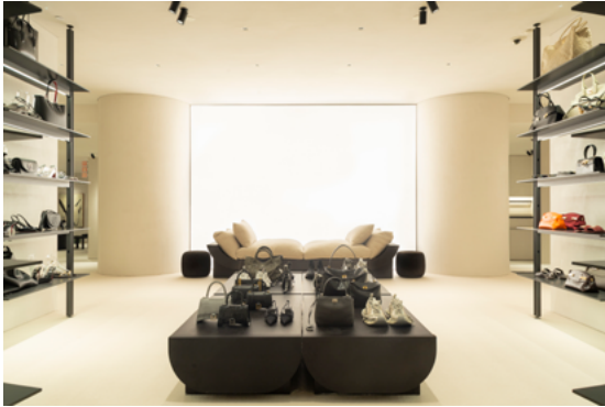
Fashion Clinic Avenida