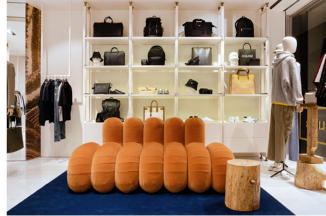
Fashion Clinic Porto