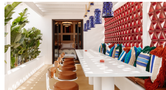
JNcQUOI Deli Suites