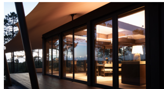
JNcQUOI Club Comporta