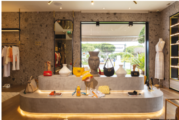
Fashion Clinic Algarve