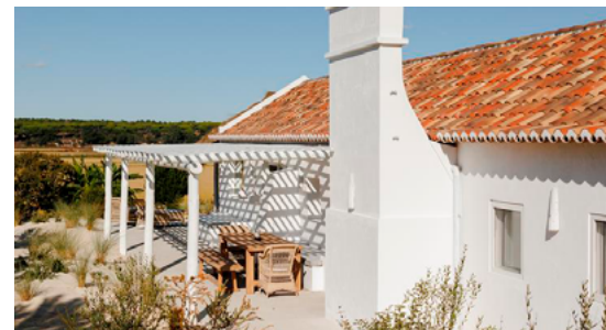
JNcQUOI Casa dos Arrozaes