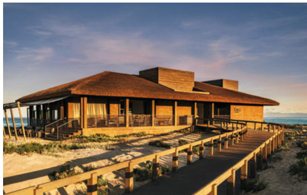
JNcQUOI Beach Club